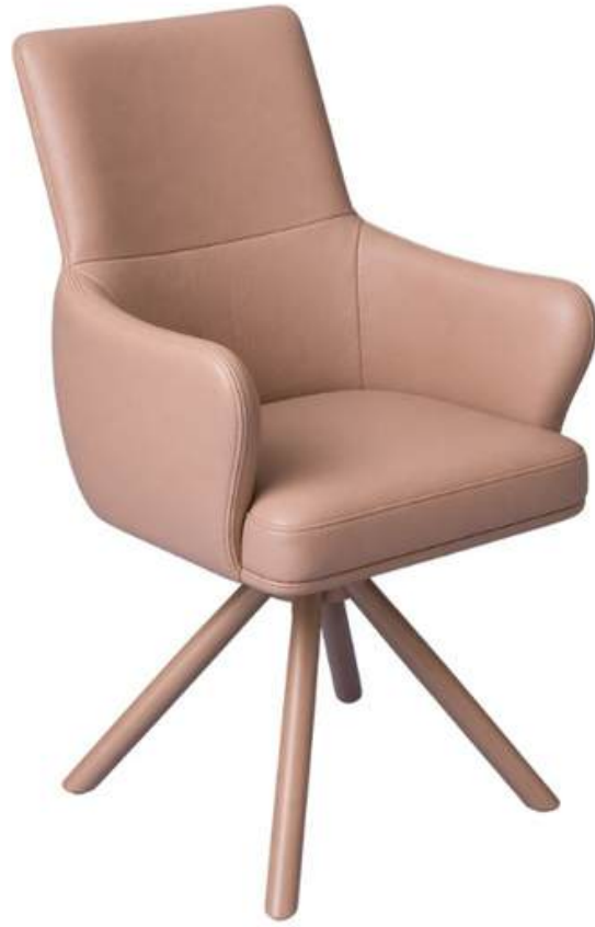
AR-12325 | FX-12025