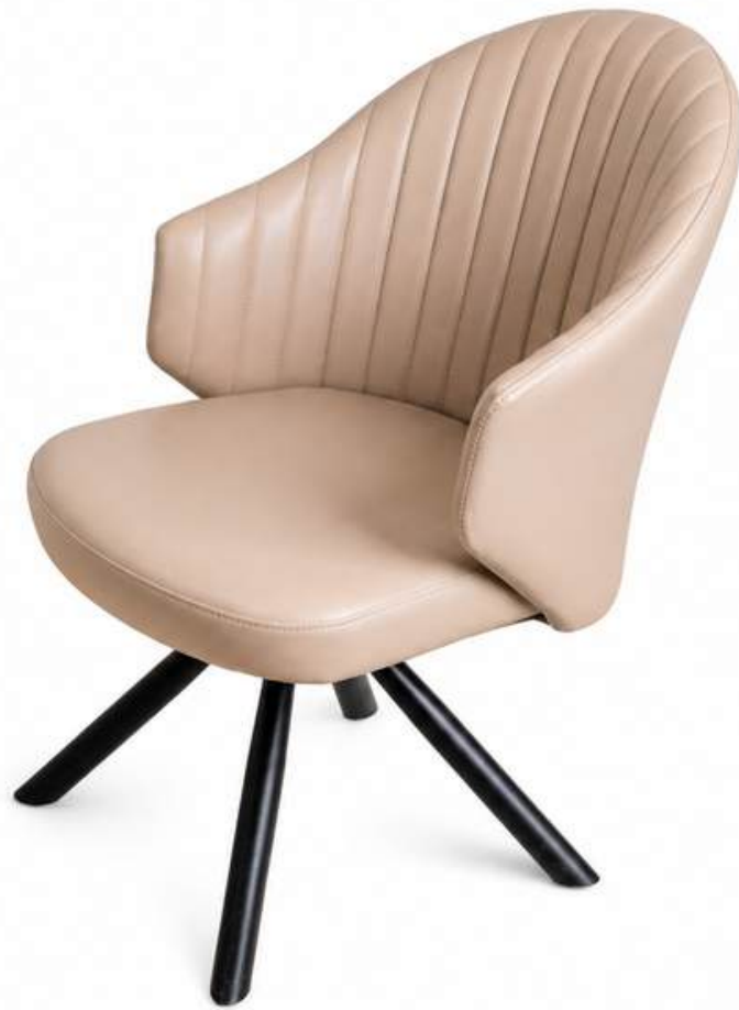
AR-12333 | FX-12033