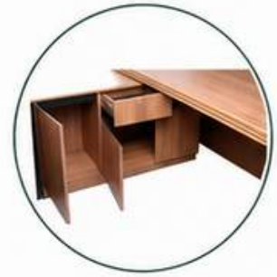
Single Seater Extension

Spacious cabinet with doors to keep your workspace organized and clutter-free.