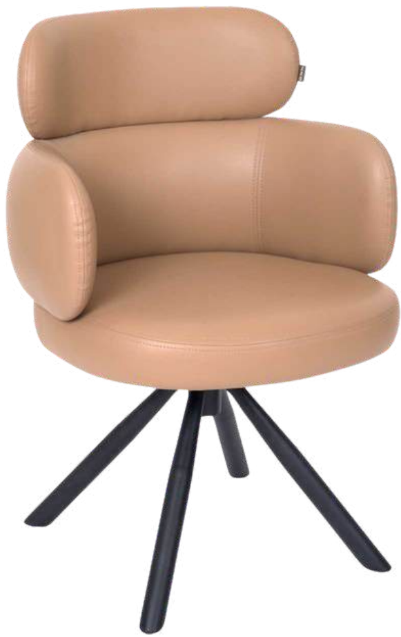
AR-12322 | FX-12022