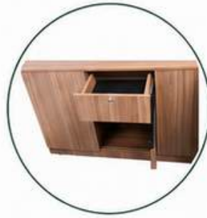
Double Seater Extension