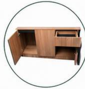
Double Seater Extension

Smooth-glide drawer for convenient access to your essentials.